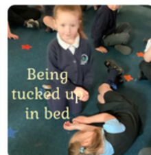
Being tucked up in bed