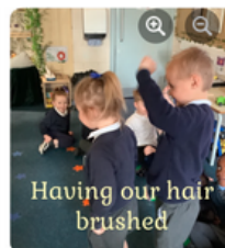
Having our hair brushed