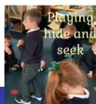
Playing hide and seek