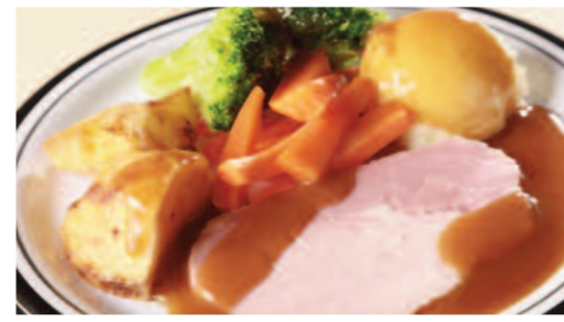
Honey Roast Gammon served with Roast/Mashed Potatoes, Seasonal Vegetables & Gravy