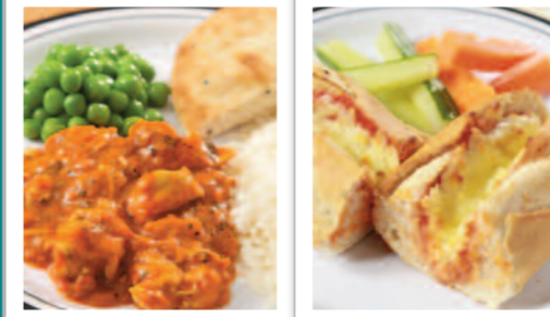
Chicken Tikka Masala served with Rice, Naan Bread & Seasonal Vegetables or Hot Pizza Baguette served with Carrot & Cucumber Sticks