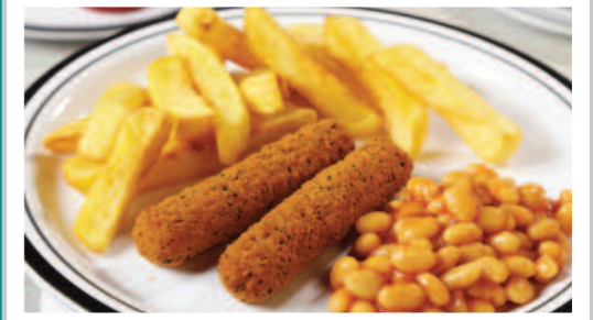
Breaded Mozzarella Sticks served with Chips & Peas or Baked Beans

VEGETARIAN VERSIONS OF THE ABOVE MEAL AVAILABLE DAILY