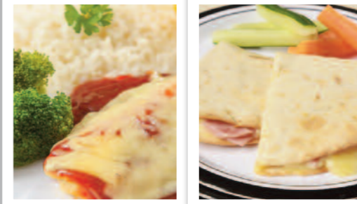
BBQ Chicken served with Savoury Rice and Seasonal Vegetables or Hot Cheese & Ham Wrap served with Carrot & Cucumber Sticks