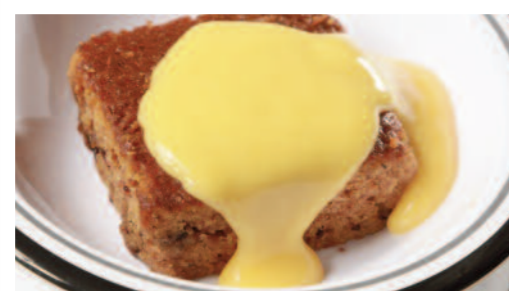
Sticky Toffee Pudding served with Custard