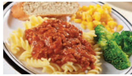
Pasta Bolognese served with Garlic & Herb Bread and Seasonal Vegetables