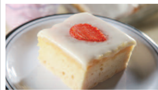
Strawberry Ice Cream Cake