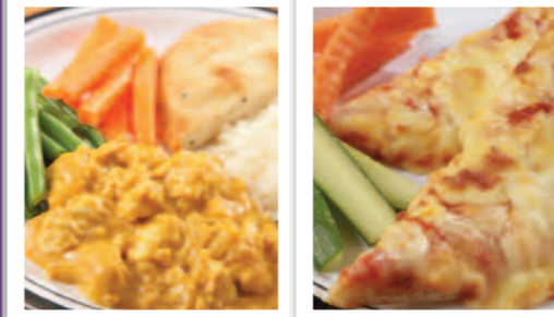
Chicken Korma served with Rice, Naan Bread & Seasonal Vegetables or Deep Pan Cheese & Tomato Pizza Slices served with Carrot & Cucumber Sticks