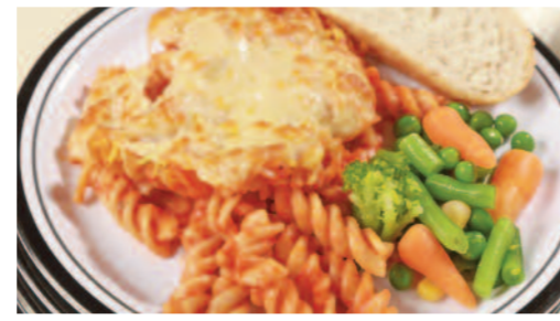
3 Cheese & Tomato Pasta served with Garlic & Herb Bread and Seasonal Vegetables