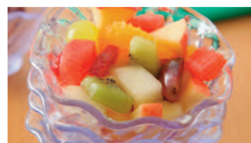
Fresh Fruit Salad