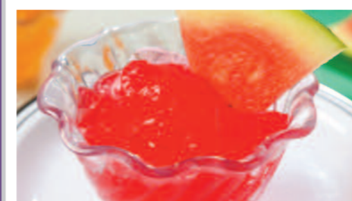
Jelly & Fruit