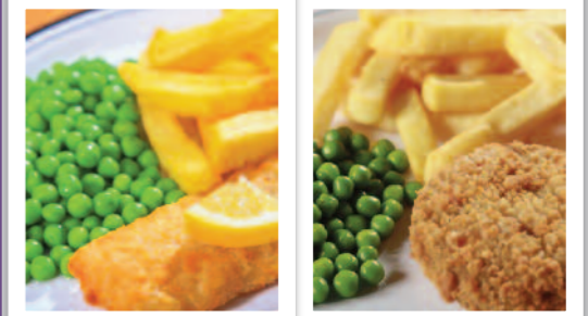
Battered Fish (MSC) or Salmon & Sweet Potato Fishcake (MSC) served with Chips & Peas or Baked Beans

VEGETARIAN VERSIONS OF THE ABOVE MEAL AVAILABLE DAILY