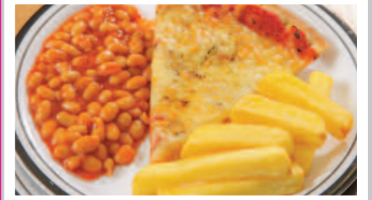
Cheese & Tomato Pizza served with Chips & Peas or Baked Beans

VEGETARIAN VERSIONS OF THE ABOVE MEAL AVAILABLE DAILY